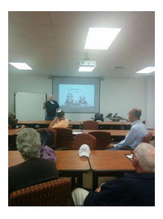
N5AC from Flex then took over and made the presentation.