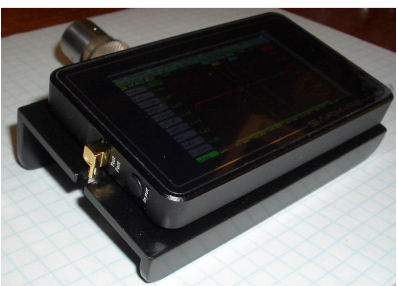
The "pebble" finish of the paint is due to my painting over the existing ridiculously-hard-to-remove beige epoxy finish on the junk box extrusion.

I will try to answer any questions you have about this project.