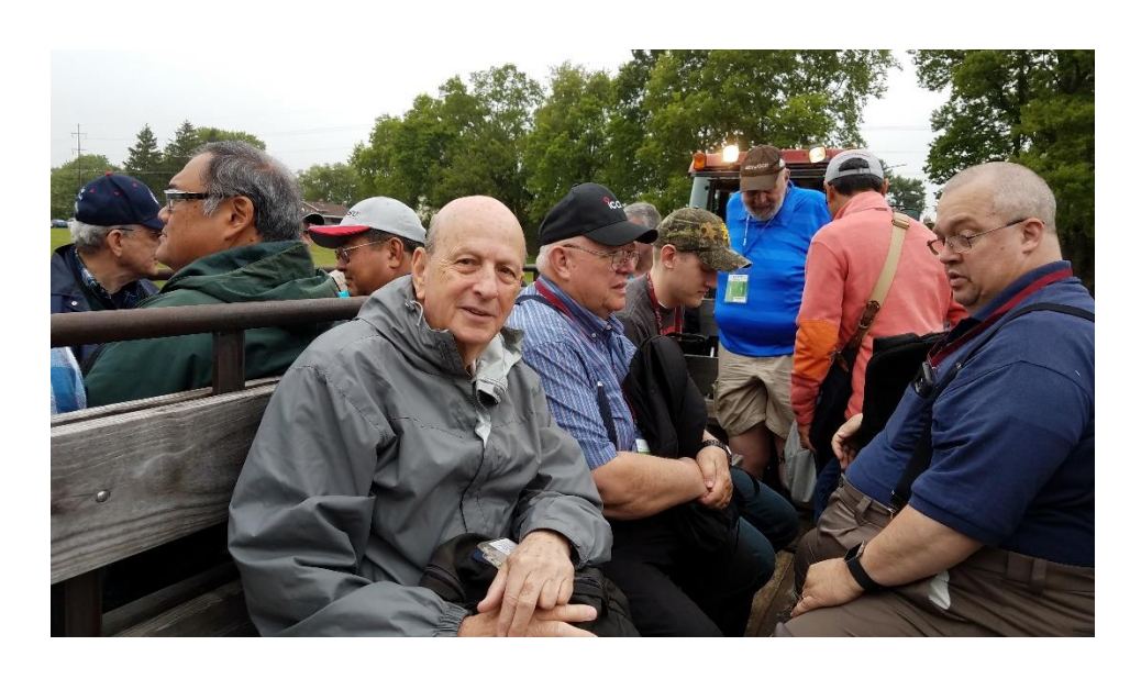
K2YWE on the hay wagon from the bus.