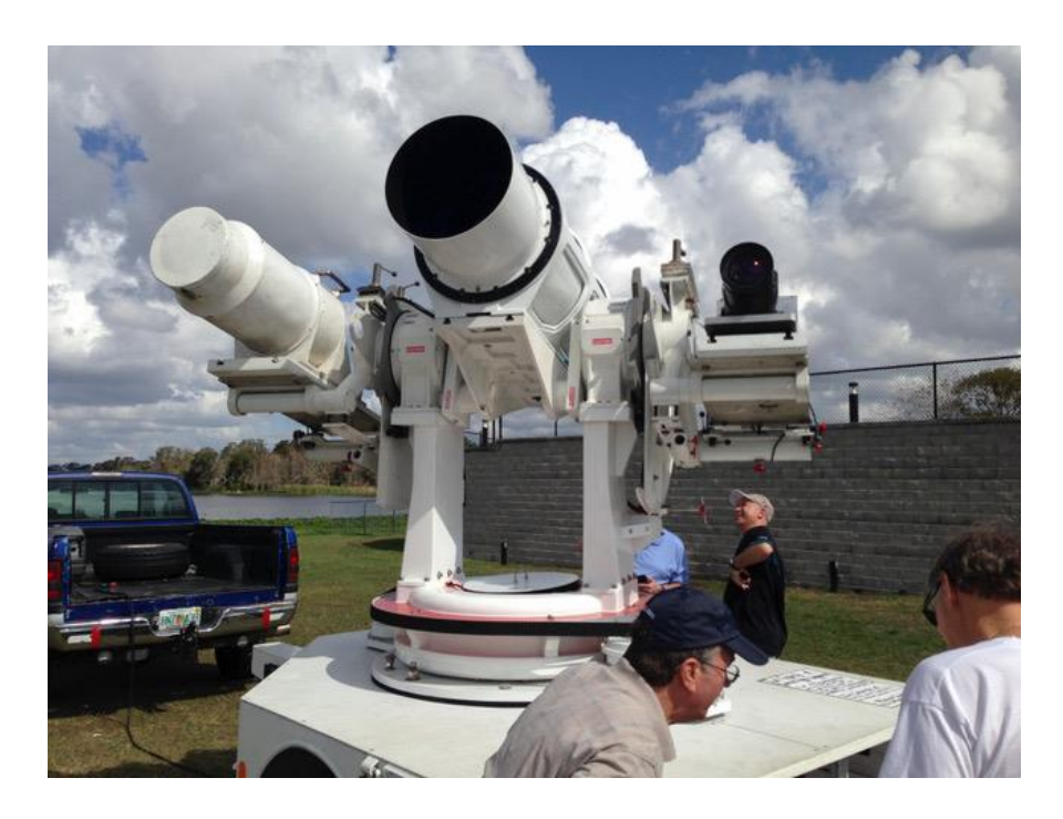
This two-scope beauty is used for tracking rocket launches.