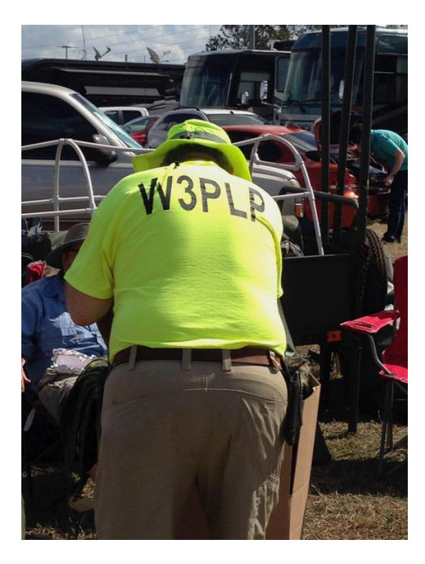
Something familiar about this guy's call....