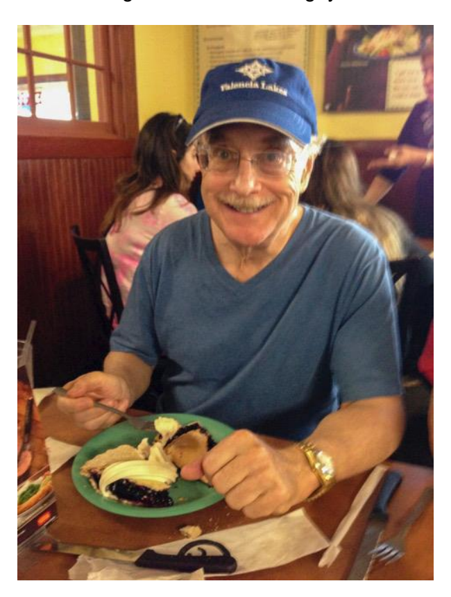
N3JT eating blueberry pie slice #5 and #6 at the Golden Corral