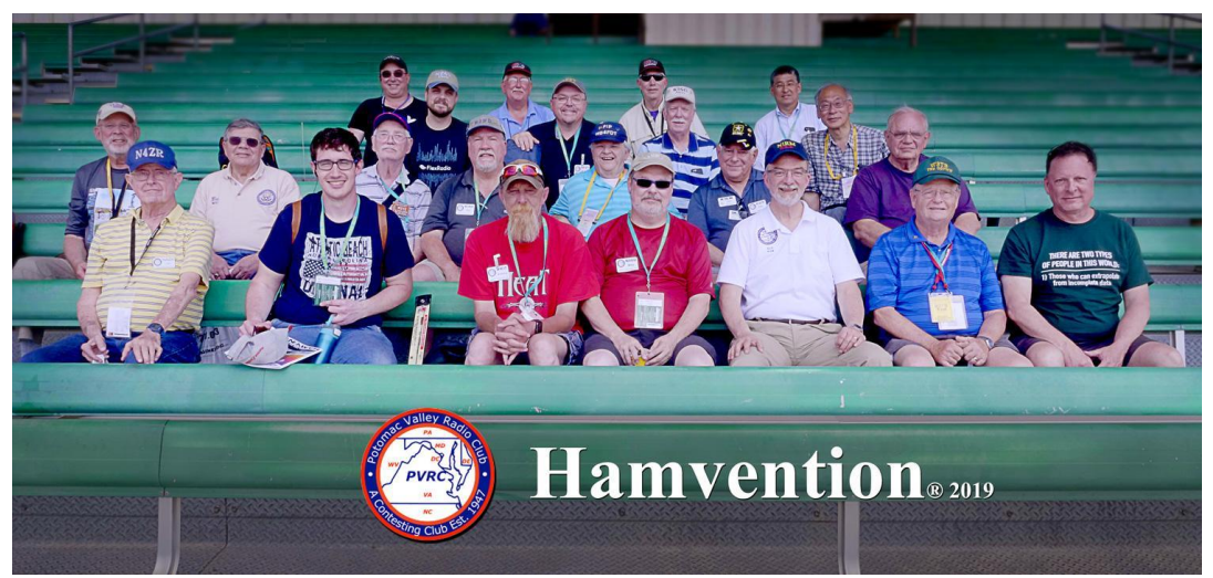
PVRCers at the Xenia meeting