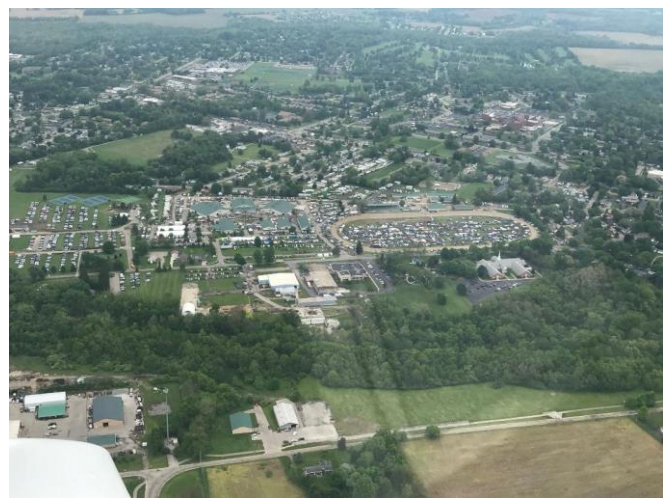
An aerial shot of the Xenia Hamvention site