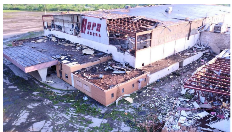
On May 27<sup>th</sup>, a week after the Hamvention in Xenia, an EF3 tornado hit Dayton and finished the process that years of neglect had wreaked on the old Hara Arena.