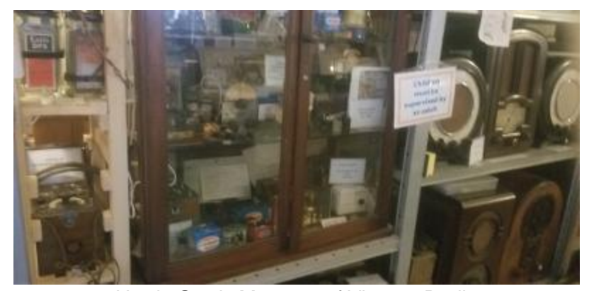
Hurdy Gurdy Museum of Vintage Radio

The station is housed in one of the many Martello towers built around 1803 to repel attack by Napoleon's forces. This one, in Howth (pronounced hoh-th), a lovely little village along the coast, hosts the Museum. It is chock full of old radios, including a spark gap transmitter. In 1903 Lee de Forest conducted wireless experiments from the tower and soon after the Marconi company used it for experiments receiving maritime wireless transmissions. The station consists of an Icom 7300 and whip antenna atop the building. The station overlooks the sea, so it does well for low power and a modest antenna. Tony is a fine CW operator, so he enjoyed copying over my shoulder! Anyway, I was on the air on Tuesday, April 12 at around 13z but no band was open to North America. My first contact was with Andy, IK5VLL; and then some other Europeans. But around 14z the band opened westward and I worked N3AM, W1RM, W4ZYT, W1EQ, WT3C, W2NR, N3IQ, W1UU, K1ESE, W4CI, K1JD, W5ZR, K9VKY, KF3B, K1EBY, VE3TM, KR2Q and others.