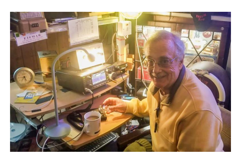
EI/N3JT operating at EI0MAR

The station is housed in one of the many Martello towers built around 1803 to repel attack by Napoleon's forces. This one, in Howth (pronounced hoh-th), a lovely little village along the coast, hosts the Museum. It is chock full of old radios, including a spark gap transmitter. In 1903 Lee de Forest conducted wireless experiments from the tower and soon after the Marconi company used it for experiments receiving maritime wireless transmissions. The station consists of an Icom 7300 and whip antenna atop the building. The station overlooks the sea, so it does well for low power and a modest antenna. Tony is a fine CW operator, so he enjoyed copying over my shoulder! Anyway, I was on the air on Tuesday, April 12 at around 13z but no band was open to North America. My first contact was with Andy, IK5VLL; and then some other Europeans. But around 14z the band opened westward and I worked N3AM, W1RM, W4ZYT, W1EQ, WT3C, W2NR, N3IQ, W1UU, K1ESE, W4CI, K1JD, W5ZR, K9VKY, KF3B, K1EBY, VE3TM, KR2Q and others.