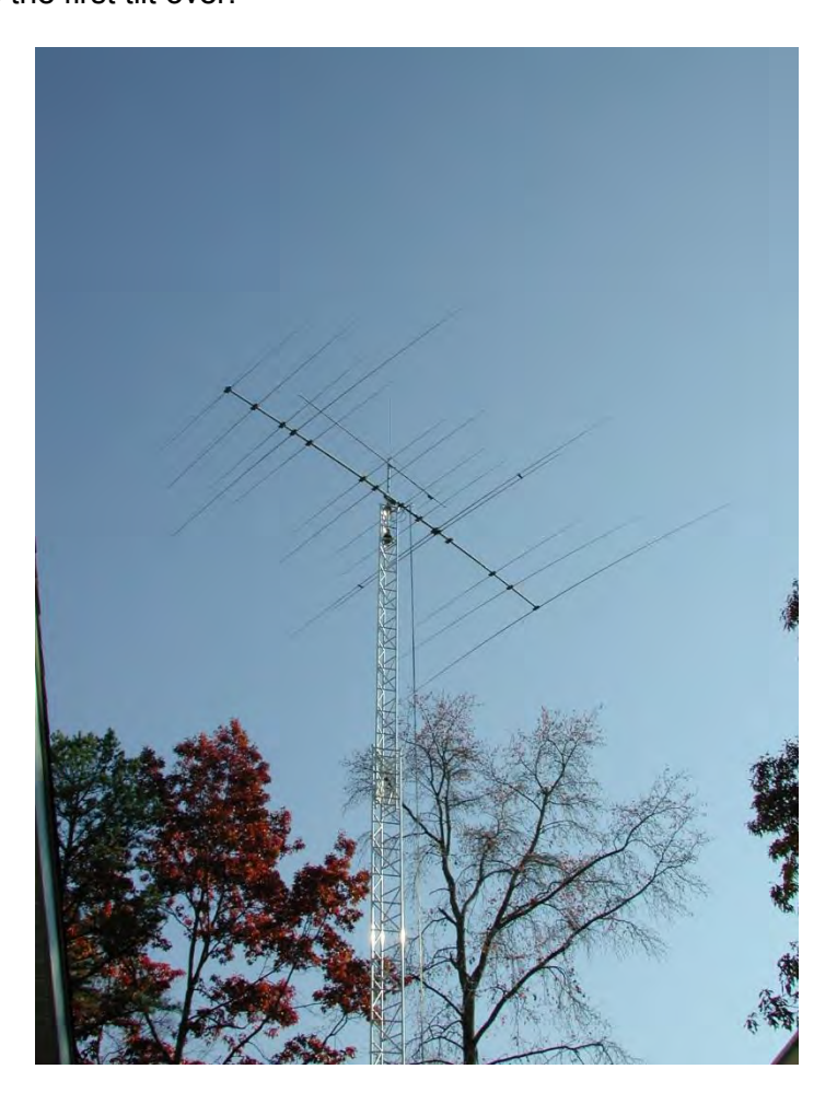
It certainly was a pretty sight for me to see it all away up with antennas. The bottom antenna is a Forced 12 C 31 XR, Cush craft 13 element 2 m, and topping it off a vertical 6 2 440 vertical.