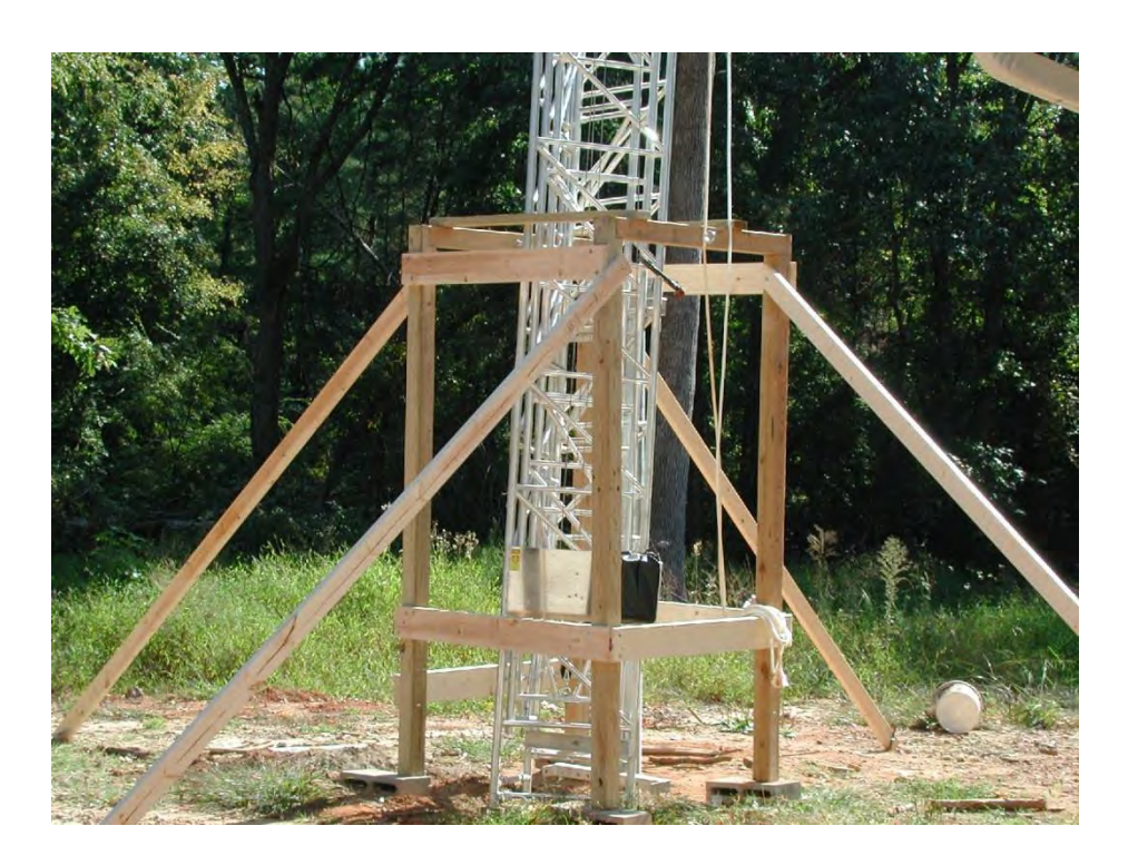
I know I won't get any style points but it worked.