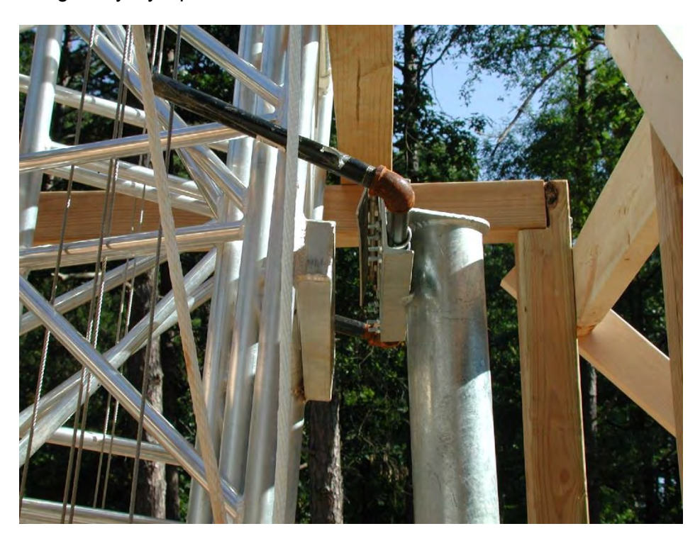
This is a close-up of the pipe I used to hold the tower from moving sideways. You can see the hinge just to the left of the pipe elbow and the block further to the left on the tower. These two points have to match up so I used a come-along attached to the 4 x 4 frame and tower to lift it the few inches I needed.