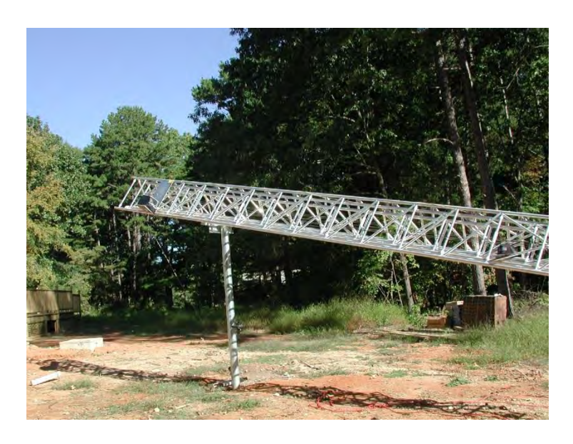
It worked - this is the first tilt over.