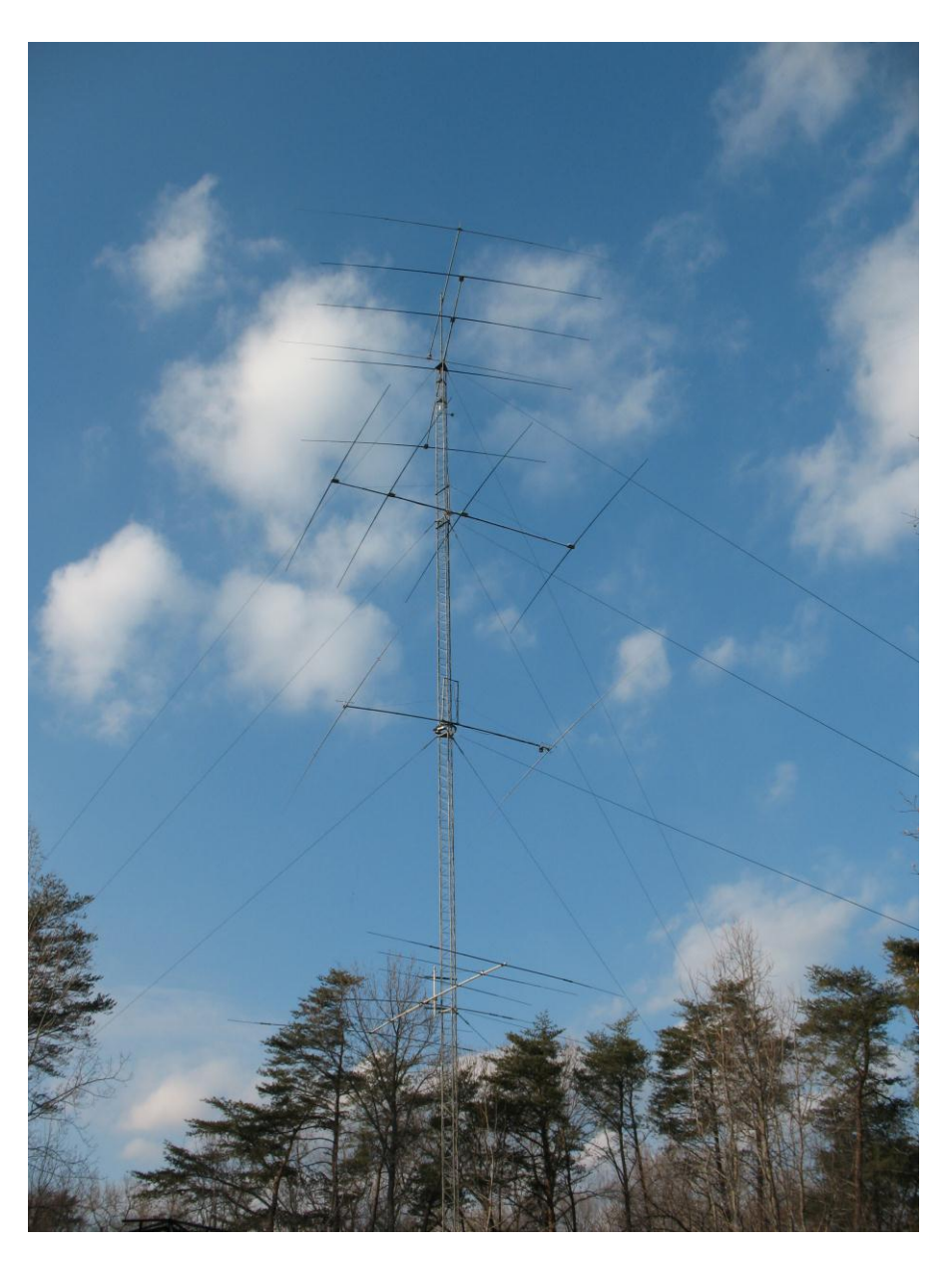
Ant: 10 - 20, pair of 4 el. SteppIRs (one at 130 ft the other fixed on Europe at 100 ft); TH6DXX fixed SE at 40 ft 40, pair of F12 EF240Xs (one at 142 ft the other at 70 ft) 80, xmit on inverted vee with apex at 120 ft; reception pair of 480 ft Beverages (one NE other W)

Software: WL w/ MMTTY run on a single computer. All antennas, except the Beverages, are mounted on a 130 ft tower.