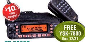
FT-7800R 2M/440 Mobile