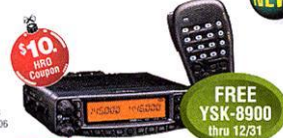
FT-8900R Quadband Transceiver