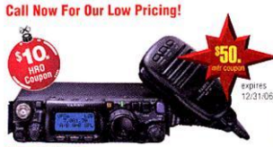
FT-817ND HF/UHF/HT TCVR