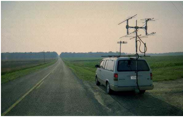
KC3WD/R might be thinking "On the Road Again"

miles and operate from 10 to 15 Grid Squares, even in January, foul weather notwithstanding! Brian and Bill both have stations equipped with bands from 50 MHz through 47 GHz, and Matt is on through 10 GHz. All three have laser-light stations and W3IY's Rover station includes 76 GHz in the mix. Keeping my [home] station on the air is difficult at times, but these guys seem to be able, with a lot of in-between-contest maintenance, to keep their gear up and running. Giving, and getting one or two band QSOs from these stations can really add up for you and them, so when you hear them on from a new Grid Square, try hard to work 'em!