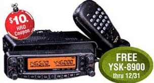
FT-8800R 2M/440 Mobile