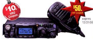
FT-817ND HF/UHF/HT TCVR