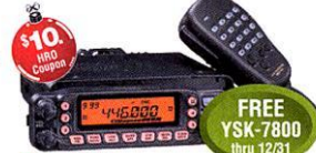
FT-7800R 2M/440 Mobile