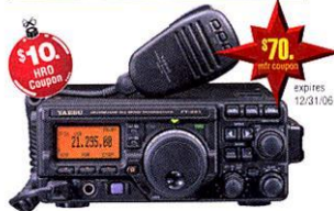
FT-897D VHF/UHF/HF Transceiver