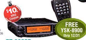
FT-8900R Quadband Transceiver