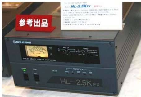
Japan Hi-Power Amp—1.5 KW solid state