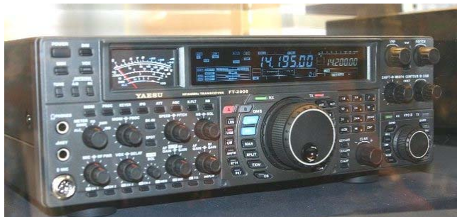
Yaesu FT-2000, successor to the 1000MP