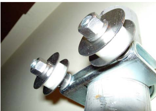
Rollers U-bolted to the top of the mast; truss cables pass up and over, then out to boom ends

I thought that it might be a good idea to just run those support cables through some kind of pulley or guide at the connection point to the mast and orient the turnbuckles at a lower point where they would be accessible without standing on top of the tower.