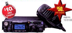
FT-817ND HF/UHF/HT TCVR