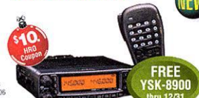
FT-8900R Quadband Transceiver