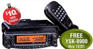
FT-8800R 2M/440 Mobile