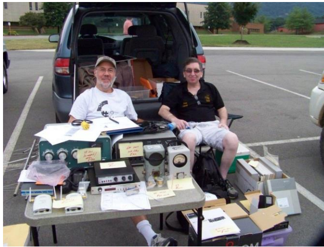
N2QT and K2KW (if you see anything you need on the table, I've still got it!)